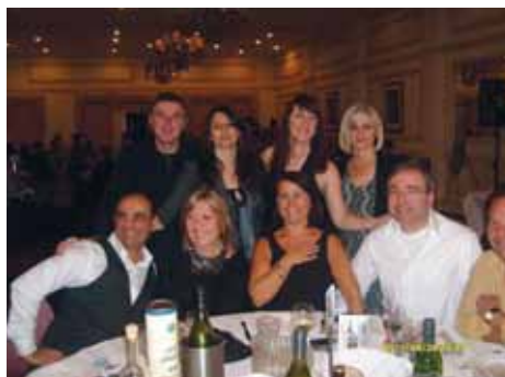
Parents at AGS Tavern Night