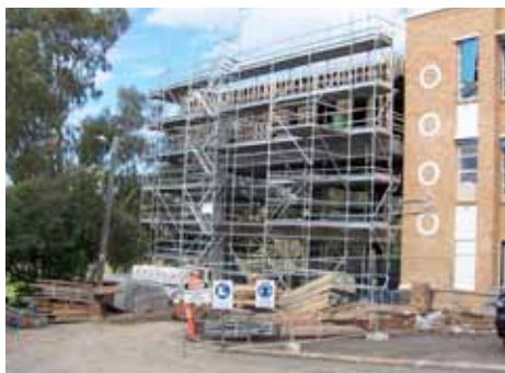
Under Construction September, 2010