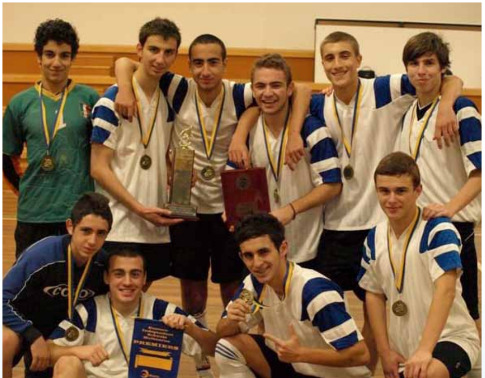
EISM Futsal Champions Team 2010