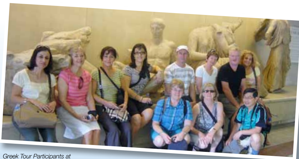
Greek Tour Participants at Acropolis Museum in Athens.

We travelled in two vans, which allowed us to explore at our own pace. We crossed into the Peloponnese, an area of southern Greece long since separated from the mainland by the amazing engineering feat of the Isthmus of Corinth. From there we made our way to Kalamata, of olive fame, stopping to see Epidavros, the first theatre ever built in ancient Greece and the largest remaining intact and operating to this day. Several days of exploring