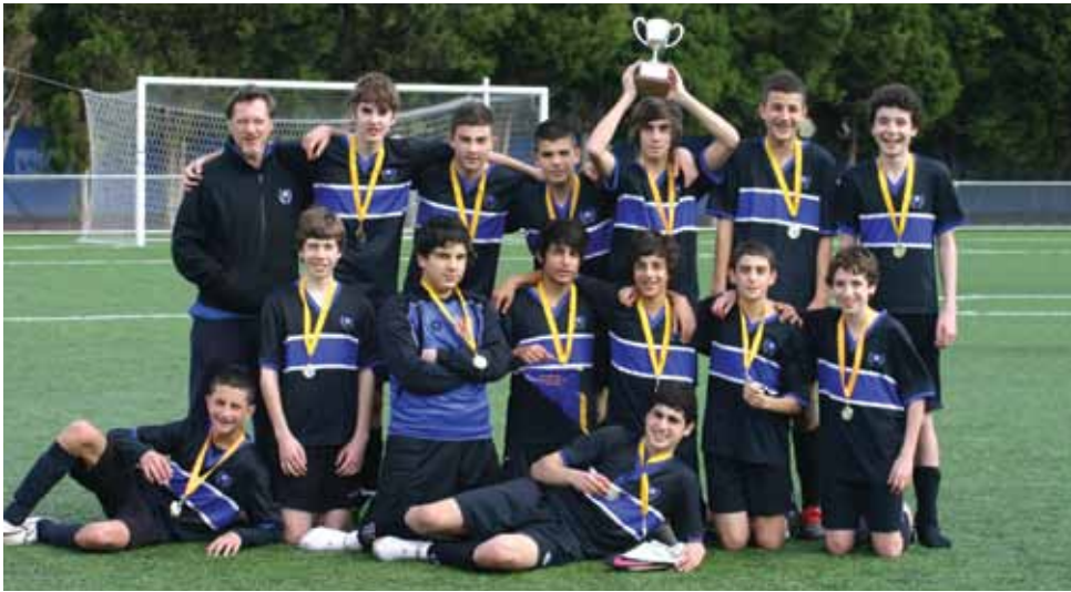
EISM Central Division Soccer Premiers