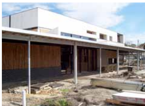
Multi Purpose Hall