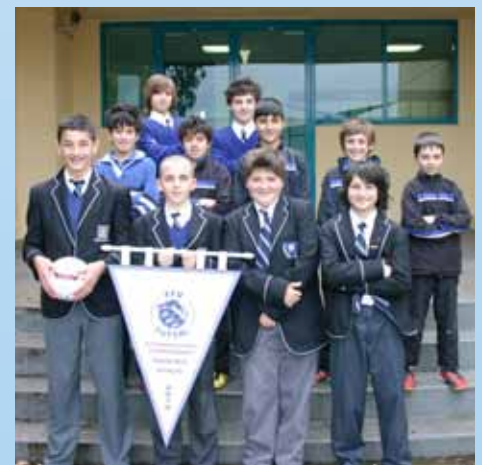
Primary School Futsal Champions, 2010