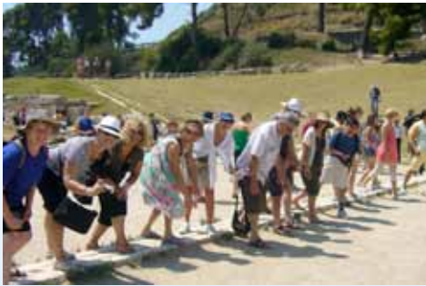
AGS Staff at Olympia starting line

Participants in the Educational and Cultural Tour to Greece – July 2010